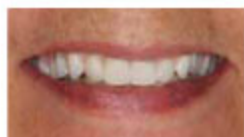
Fig. 24: Wax try-in

It is finally here, delivery day! It is normal to have to adjust the dentures for ease of insertion and removal. Once these sore spots are adjusted, the occlusion can be confirmed. The dentures should have simultaneous bilateral contact into closure, as well as have simultaneous contacts in excursions. As a rule of thumb, when the patient returns for post-op visits, adjustments are only made to the internal aspect of the denture if the patient states that