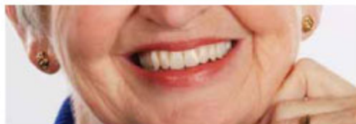
Fig. 25: Post-op headshot

the offending area hurts during insertion or removal of the denture. Otherwise, if the denture does not hurt to insert or remove, but becomes sore after a period of use, the occlusion should be considered the cause.